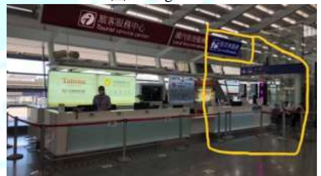
圖五 Figure 5