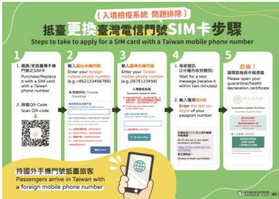
圖一 Figure 1